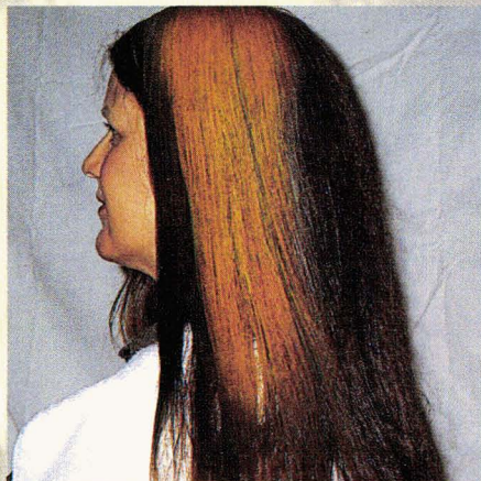
STEP 4 Now I spray the orange.