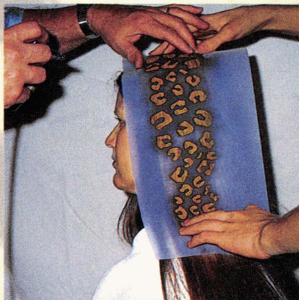
STEP 5 I position the stencil and spray the leopard spots black.