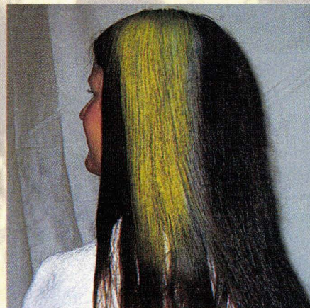
STEP 3 I spray yellow to brighten up my next color, which is orange.